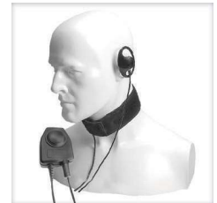
CXR16/750 ■ CXR16/950 ▲ Throat mic. Bone conductive