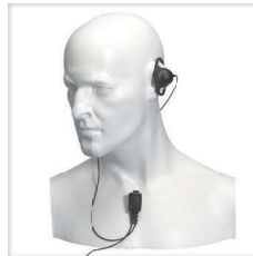
EA12/750 ■ EA12/950 ▲ Earpiece microphone