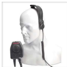
CXR5/750 ■ CXR5/950 ▲ Skull mic. Bone conductive