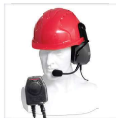
CHP750HS ■ CHP950HS ▲ Hard hat eardefender, submersible PTT

Submersible products are represented with a water droplet.