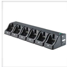
CSBHT ■ Six-way charger

HT649 GMDSS can be supplied in different package combinations, please consult your dealer.