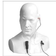
EA15/750 ■ EA15/950 ▲ Covert earpiece / microphone